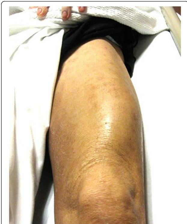
Figure 1 Swelling of the left quadriceps, intramuscular abscess, and pyomyositis.

ED bedside dynamic compression ultrasonography was performed on both anterolateral thighs (see Additional files 1, 2, and 3 available as supporting information in the online version of this paper). Examination of the right anterolateral thigh and quadriceps muscle was unremarkable (Figure 2 and Additional file 1). Bedside dynamic compression musculoskeletal ultrasonography examination of the