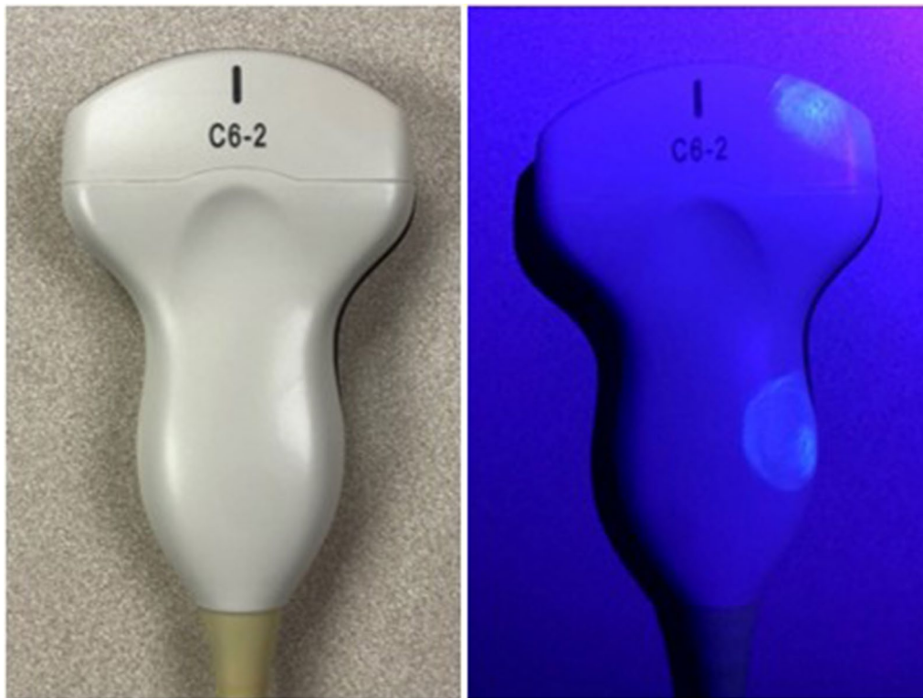
Fig. 2 Fluorescent gel marks. Pictured is a curvilinear probe used to exemplify the size and location of fluorescent marks under ambient room light (left) and UV light with room lights turned off (right)