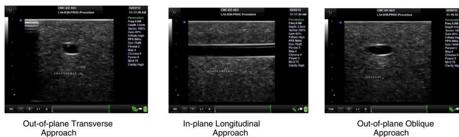
Figure 2 Sonographic view of each approach. Out-of-plane Transverse Approach, In-plane Longitudinal Approach, Out-of-plane Oblique Approach.

Table 1 shows the mean, median, maximum, and minimum scores for time to aspiration and number of attempts overall. The mean time to complete each approach was 9.47, 9.74, and 12.50 seconds for T, L, O approaches, respectively. When comparing the T, L, and O approaches for time, the p value was 0.572. The mean