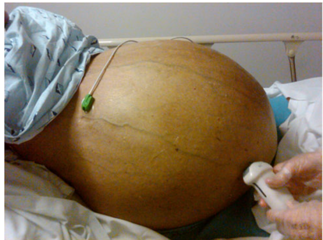
Fig. 1 Patient's abdomen revealing massive distention and spider angiomata

An 86-year-old woman presented via ambulance to the Emergency Department after falling and being unable to get up. She reported progressive abdominal distention and weight gain over the past several years, and stated that the weight of her abdomen had prevented her from standing up after her fall. She denied pain of any kind, but did report increasing dyspnea on exertion over the last few weeks. Physical findings included massive abdominal distention with spider angiomata (Fig. 1), decreased bowel sounds, and no tenderness to palpation. While considering a diagnostic and therapeutic paracentesis, the treating physician